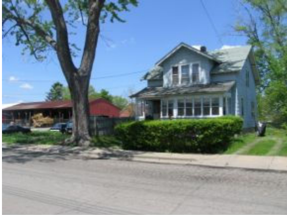
91-95 Olive Street